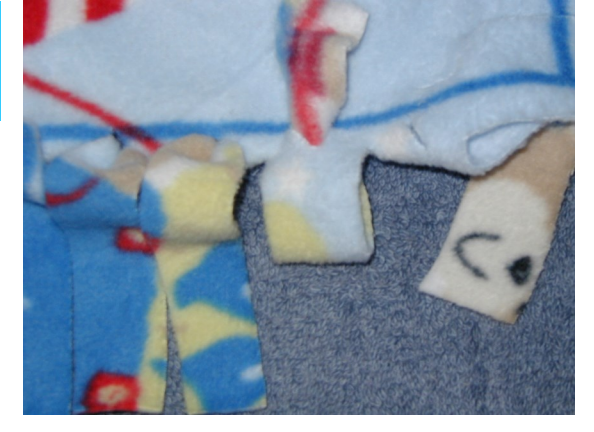
Visit us at: www.projectlinus.org

© 2006-2017 Project Linus National Headquarters All Rights Reserved